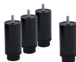
4 HEIGHT ADJUSTABLE LEG KIT